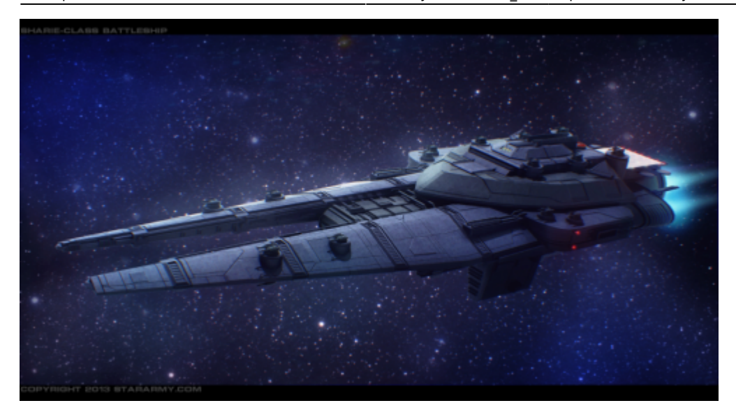
The YSS Takamagahara is a Sharie-class Battleship serving largely in the turbulent Yugumo Cluster and wherever else the Tenth Fleet requires her. The YSS Takamagahara is unique that it is crewed entirely by mini Nekovalkyrja. (OOC Note: now an NPC unit)