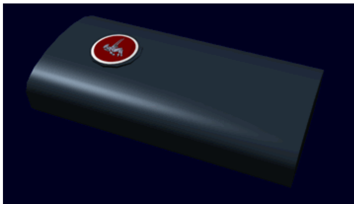
Communicator in Gray