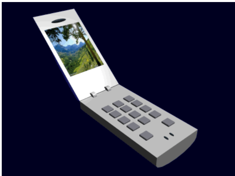
Communicator with camera open flipped up