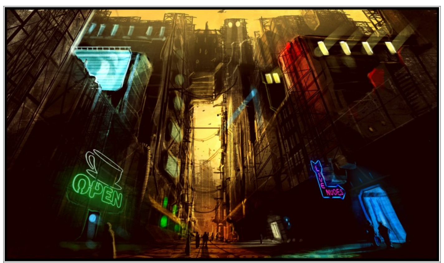
The dark and dirty streets of Funky City are host to taverns, shops, and heavily armed Nepleslians. Art by David Holland.