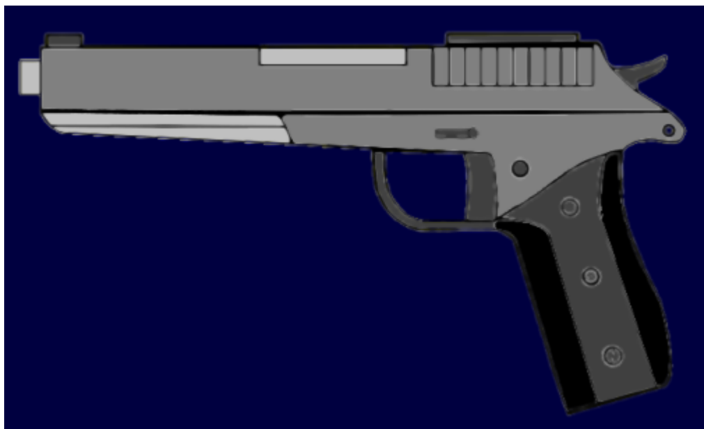
Full Size Arbitrator