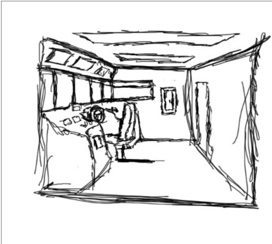
Conceptual Art Of The Standard Compartment

The spacious driving compartment is sectioned off from the rest of the Sandcrawler with a single door as the only entry or exit point unless it is an emergency in which case an emergency escape hatch is located on the ceiling with a ladder attached to climb out. The compartment itself is usually quite spartan, Ahmida typically leaving it up to the consumer to decorate or modify at their discretion. The sole item of the compartment they tend to expend effort on is the driver's seat. The seat itself is genuine Herditan Leather with arm rests. The material within the seat is typically a form of memory foam that conforms to the driver's body providing ample comfort during the long treks.