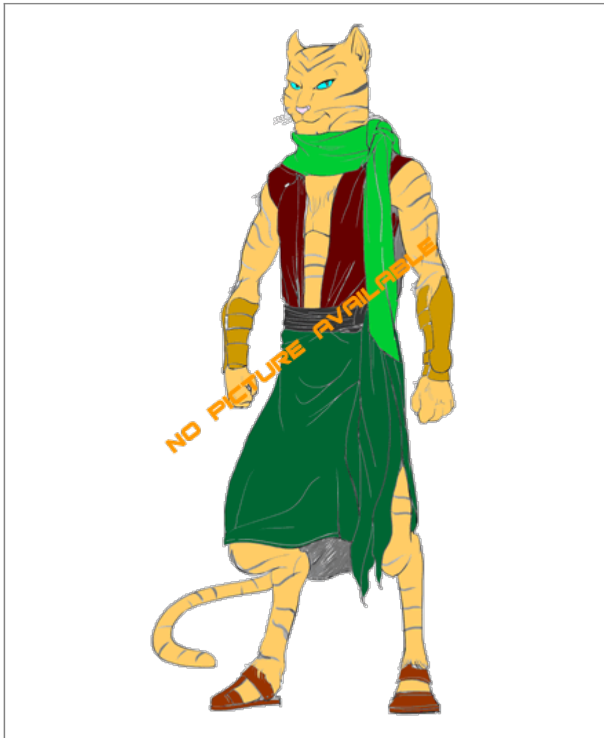
Above: This Tula is wearing a bright green Jendogo tied around their neck, a maroon Jendomu, a dark green Umatli, and maroon Bapaumati.