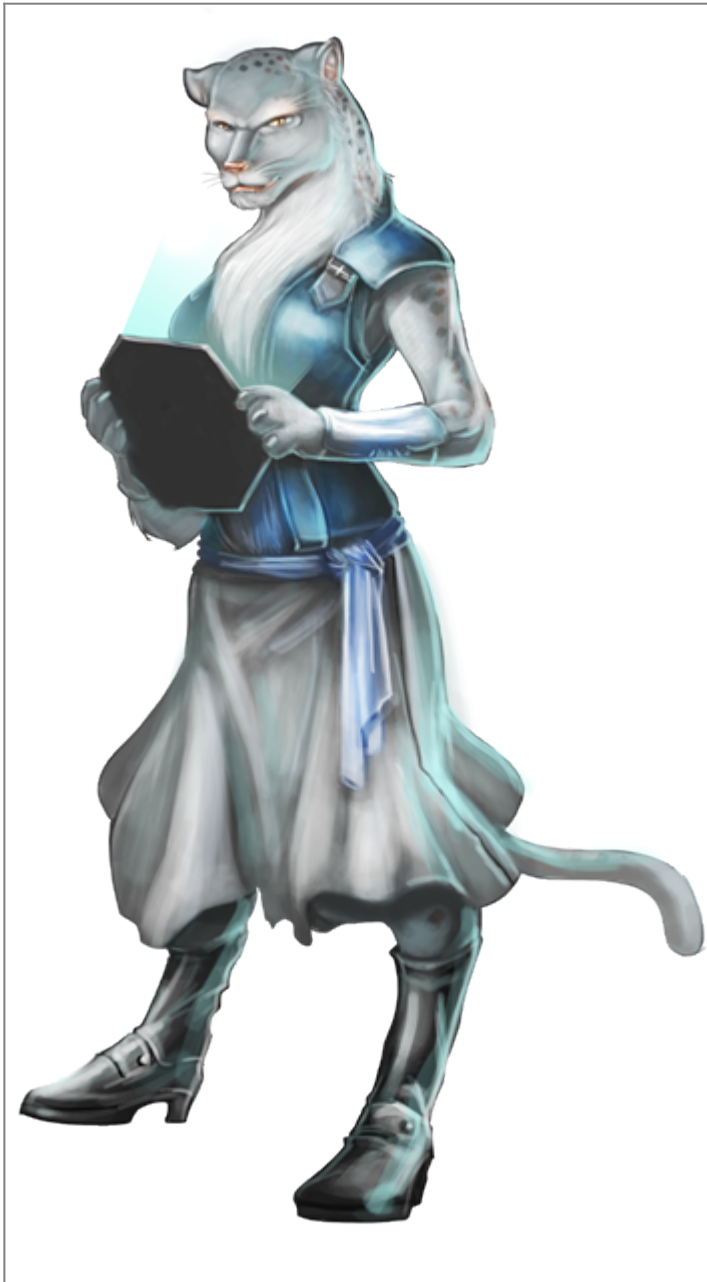
Above: This female Qaktoro is wearing a dark blue Jendomu, an ice-blue Lapurnium, a white Umatli and black Bapawotai.