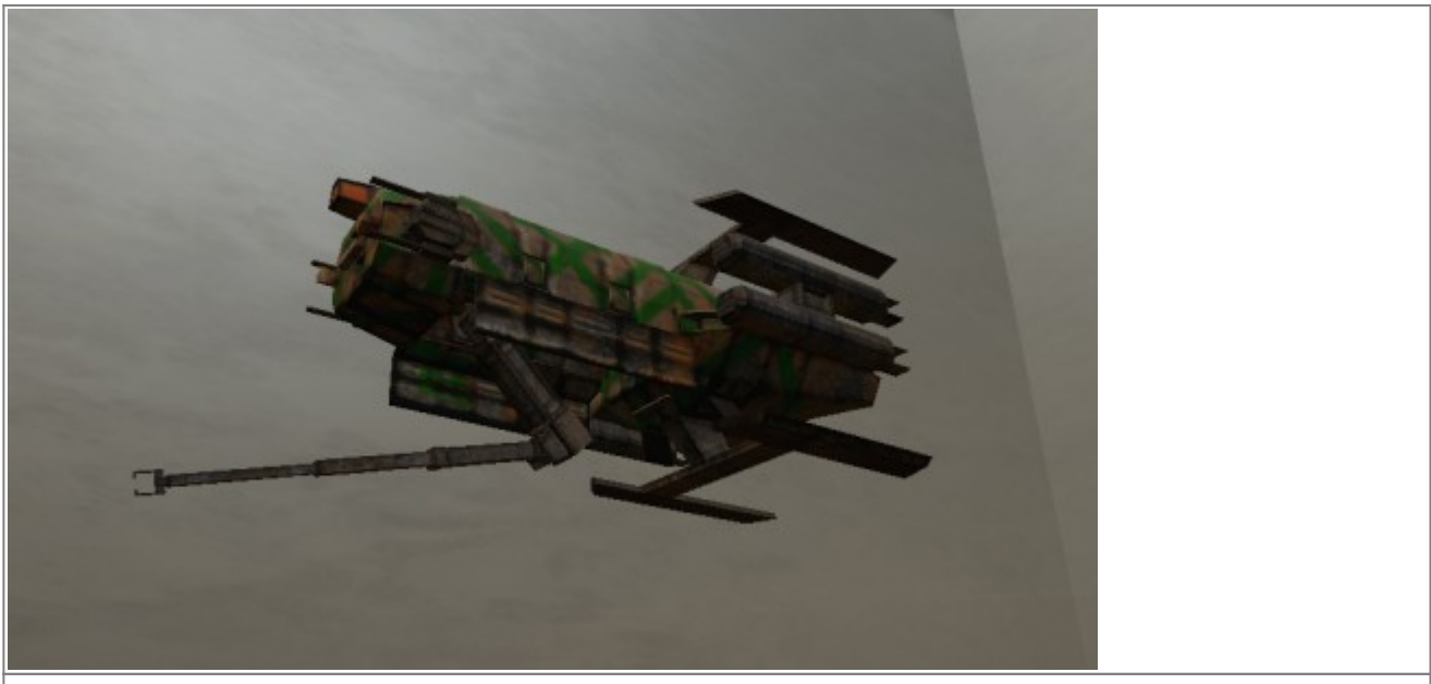
The " Reckless Abaddon ", a Nomad salvage/subterfuge ship sporting typical Viridian Array colours.

It often takes a keen eye to discern if a Freespacer craft belongs to the Viridian Array, likely only firmly established once one views the disproportionate amount of weaponry, or contacts their syntelligence directly through the polysentience. In rare cases, the particularly fanatical have been known to coat their hulls in vibrant green geometric shapes, but this is definitely an interesting exception rather than a rule.