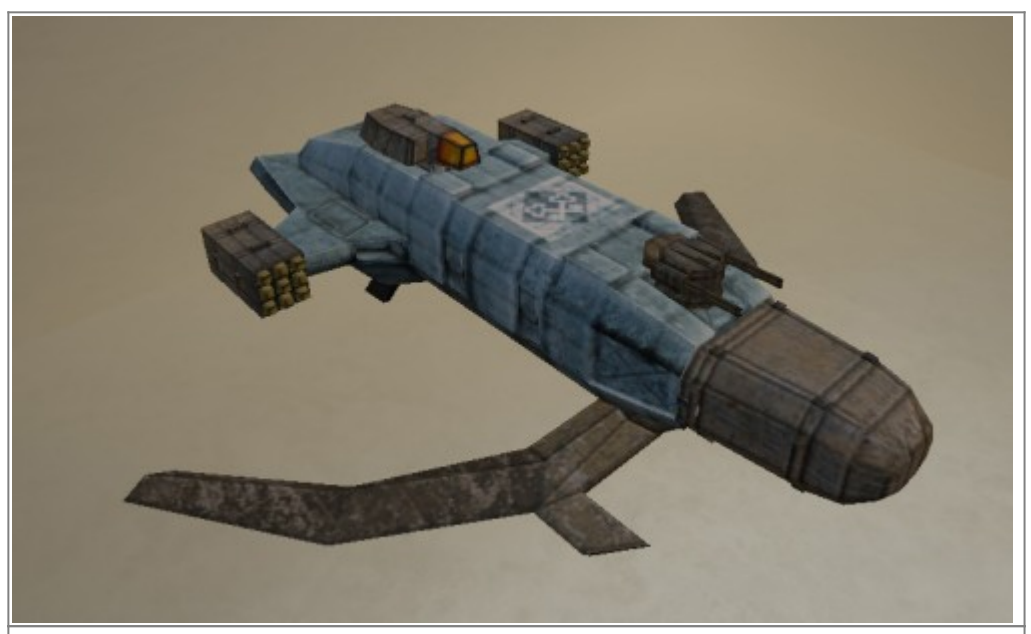
The "Silent Guardian", a Nomad gunship operated by the Astral Locksmiths.

Locksmith vessels are normally painted gleaming silver as a matter of pride, but their actual state of spaceworthiness varies greatly from vessel to vessel. The only real distinction in fleets is between roles, and between syntelligence and organic-crewed craft, due to operational differences.