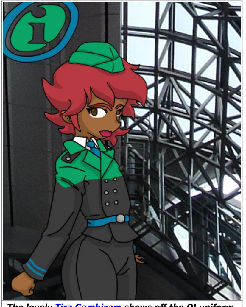
The lovely Tira Gambizam shows off the OI uniform.

The basic Origin uniform is a fusion of styles that was designed to be equally at home in the office, or out in the field. There are several variations, but most every Origin employee has at least one standard uniform.