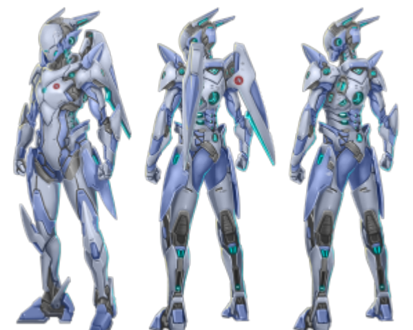
Ke-M2-4 Series "Mindy" Armor