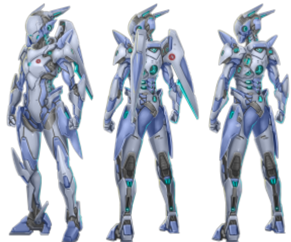
Ke-M2-4a "Mindy" Armor - art by Marwan Islami - Copyright 2015 Star.Army