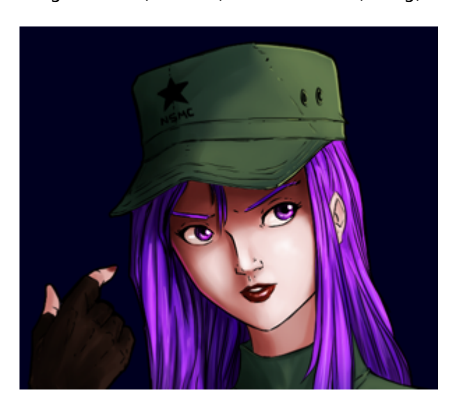
Height: 5' 3" (161 cm) Mass: 105 lbs( 47kg) Measurements: 34-24-33 in (86-60-83 cm) Bra Size: 34B