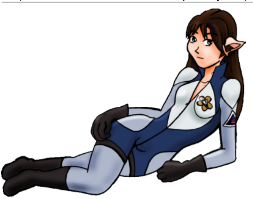
Type 21 and Type 22 gloves are the original type of gloves used by the Star Army. In the early days, they were issued with matching boots as the "TA-19 Boots and Gloves set" manufactured by WickedArms Industries and then became part of the Star Army Female Bodysuit, Type 22.