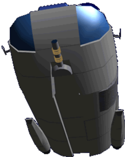
Isolated image of the Ke-T8-W3100

On this bottom view of the Kuma you can clearly see the Ke-T8-W3100.