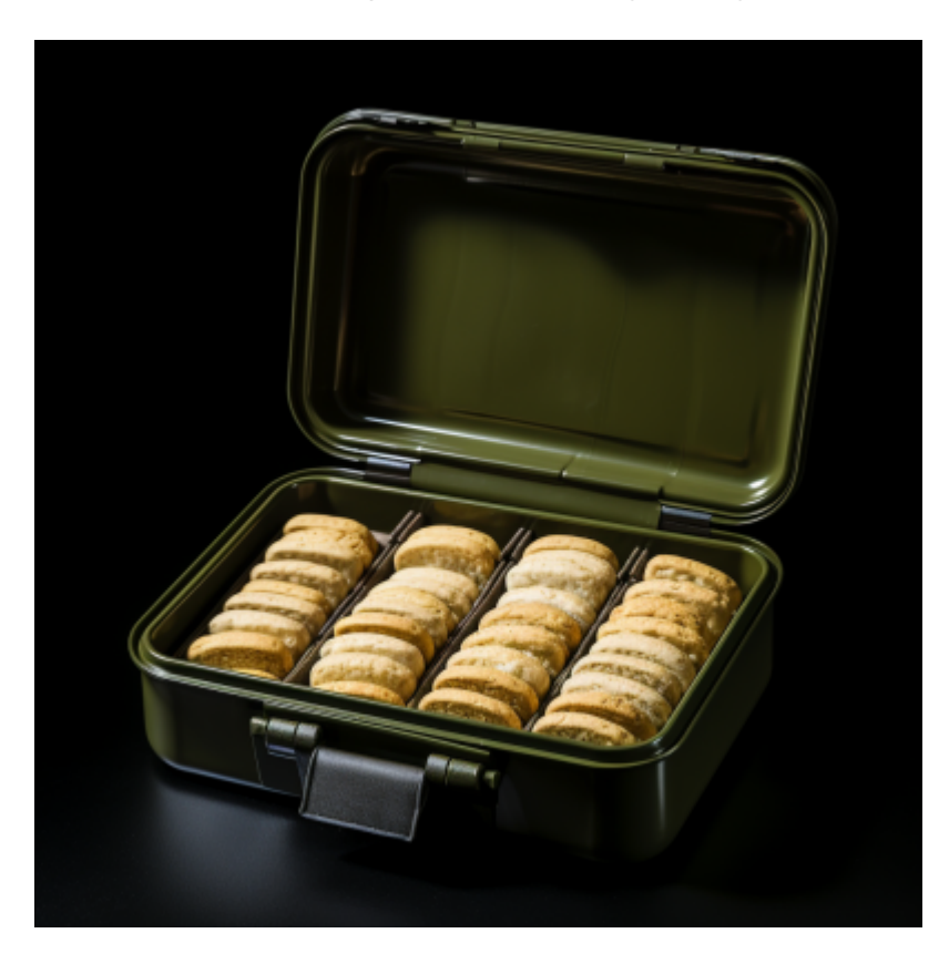
Price: 1 KS for a bag of crackers (enough to last a couple days).

Kanpan (written 乾パン in Yamataigo (邪馬台語)) is a type of \mathbf{S} Hardtack crackers manufactured for the Star Army of Yamatai. It makes a good emergency food because it lasts for a long time (many months, or years if canned). It is also extremely inexpensive (flour is one of the most calories per KS of any food) and convenient to carry because of its light weight and small size.