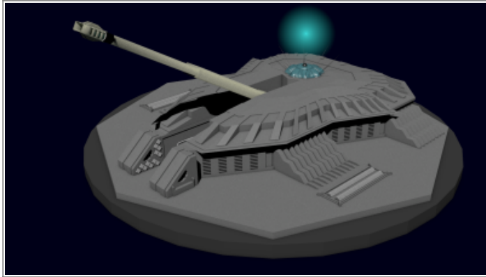
Silver-Rain Phalanx in its opened state