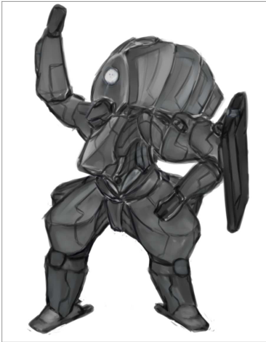
So-KM1-01a Graiv VAHIN

Graiv refers to a defender or protector , as well as the Graiv Haidan, or Defense Forces, while VAHIN an acronym for V anguard H eady I Nfantry.