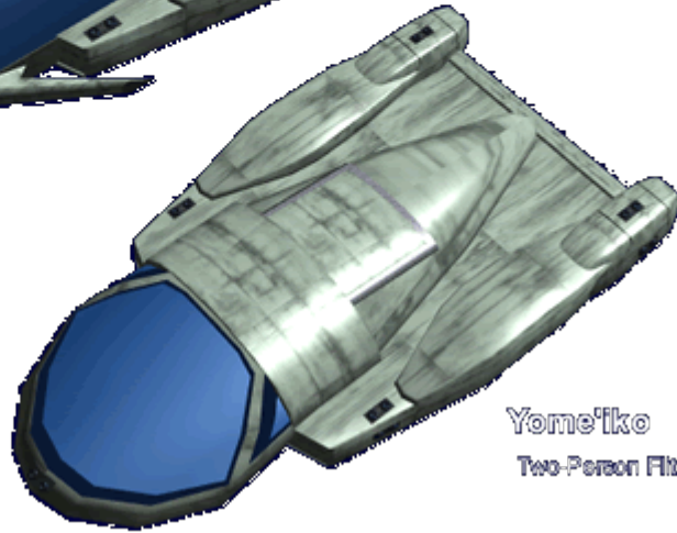
Yome'tko Two-Person Fitter