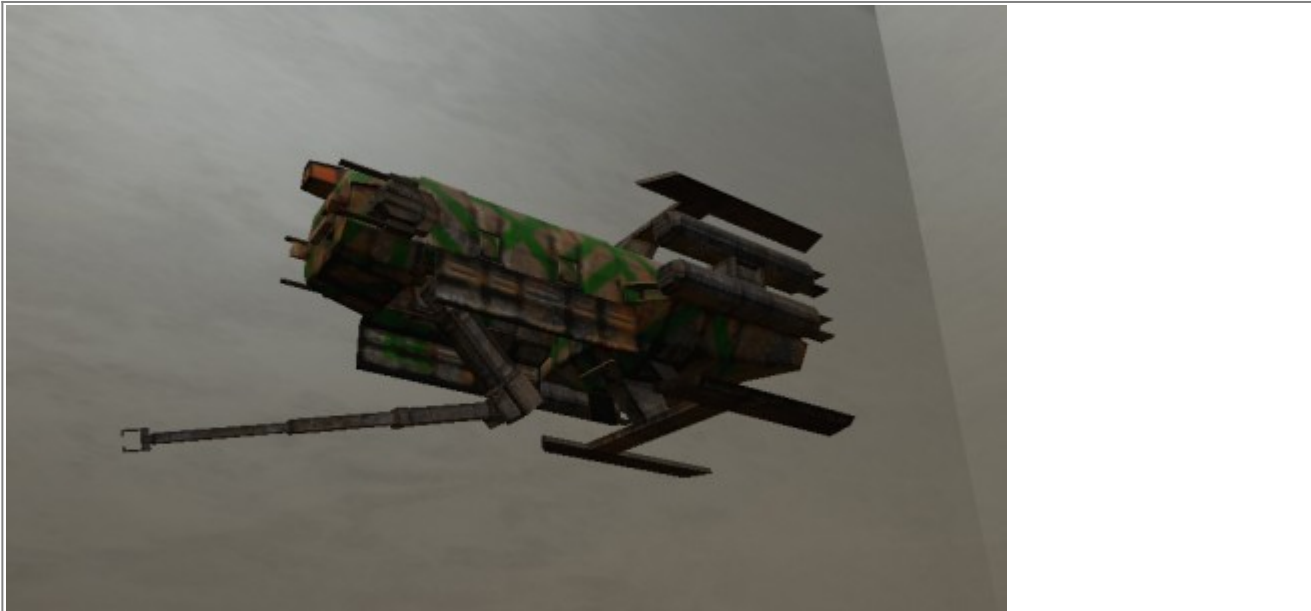
The “ Reckless Abaddon ”, a Nomad salvage/subterfuge ship sporting typical Viridian Array colours.

It often takes a keen eye to discern if a Freespace craft belongs to the Viridian Array, likely only firmly established once one views the disproportionate amount of weaponry, or contacts their syntelligence directly through the polysentience. In rare cases, the particularly fanatical have been known to coat their hulls in vibrant green geometric shapes, but this is definitely an interesting exception rather than a rule.