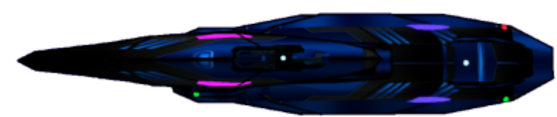
(Yūgure-class, Dorsal View)

Below are the systems of the Yūgure-class Merchant Destroyer.