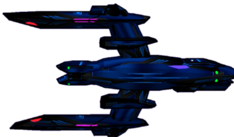
(Yūgure-class, Lateral View)

The Yūgure-class is very similar to the Misha-Class Explorer . It has the sleek maritime-esque hull and the Yūzuki (夕月, "Evening Moon") hull paint and texture. Rather than the Misha-Class style 🌐 catamaran formation for the nacelles, the nacelles are in an in-line vertical formation above and below the hull. The hull profile is designed to be compact to reduce vulnerabilities. The shuttle bay and aft section of the ship are also wider than the Misha design.