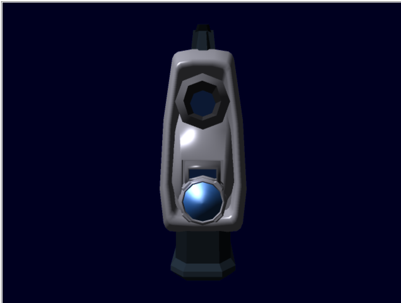
Front view, showing barrel and camera