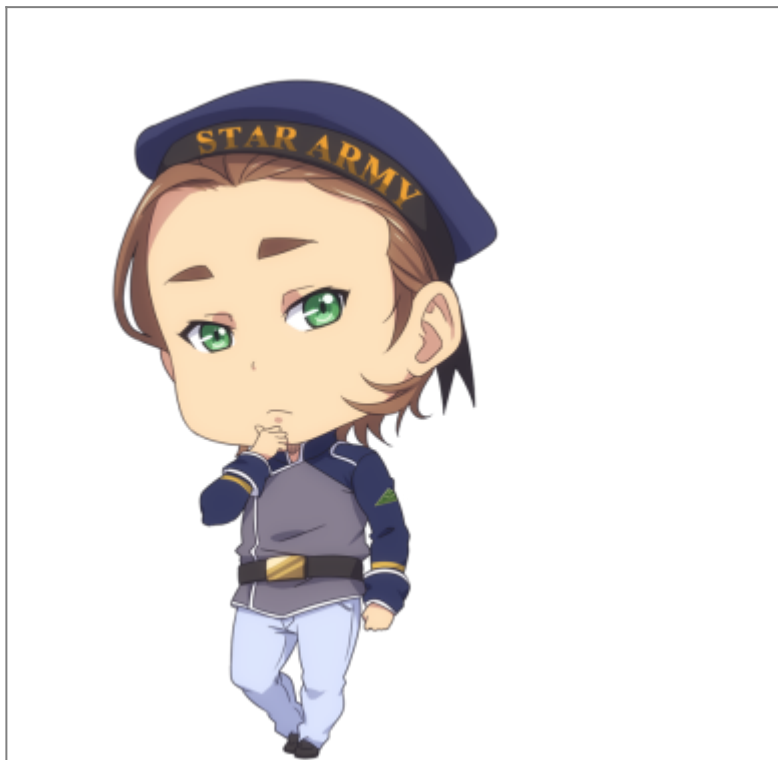
Kazuhiro in YE 34, upon joining the crew of the Sakishima .

Although Daisuke was never much of a performer, Kazuhiro has always taken his relatively minor assignments incredibly serious- which is how he's climbed to the rank of Shoi over the years. During his stint, Kazuhiro has filed every type of form in the Star Army, made every kind of pitiful petition, scrubbed every form of latrine. All of this, in the most backwater regions possible for his superiors to place him. Over time, he grew in rank from a simple operator to full-fledged officer status. His first year as an officer was relatively uneventful, flying patrols through the safest trade-lanes on the charts and serving on ships headed in for decommission. It was only in YE 34 that he was finally brought to a meaningful post. He was assigned as First Officer of the escort destroyer, YSS Sakishima .