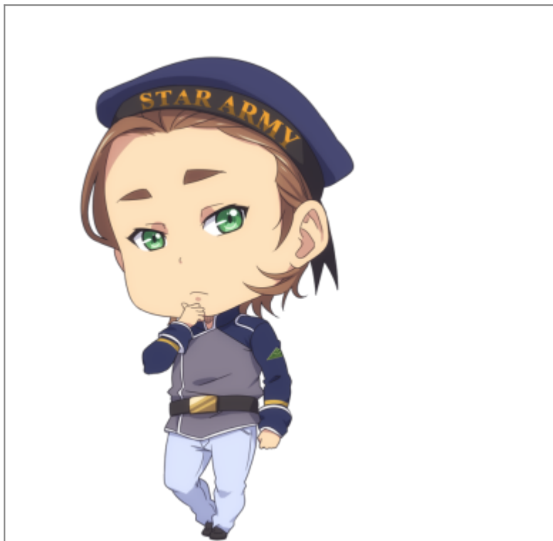
Kazuhiro in YE 34, upon joining the crew of the Sakishima .

Although Daisuke was never much of a performer, Kazuhiro has always taken his relatively minor assignments incredibly serious- which is how he's climbed to the rank of Shoi over the years. During his stint, Kazuhiro has filed every type of form in the Star Army, made every kind of pitiful petition, scrubbed every form of latrine. All of this, in the most backwater regions possible for his superiors to place him. Over time, he grew in rank from a simple operator to full-fledged officer status. His first year as an officer was relatively uneventful, flying patrols through the safest trade-lanes on the charts and serving on ships headed in for decommission. It was only in YE 34 that he was finally brought to a meaningful post. He was assigned as First Officer of the escort destroyer, YSS Sakishima .