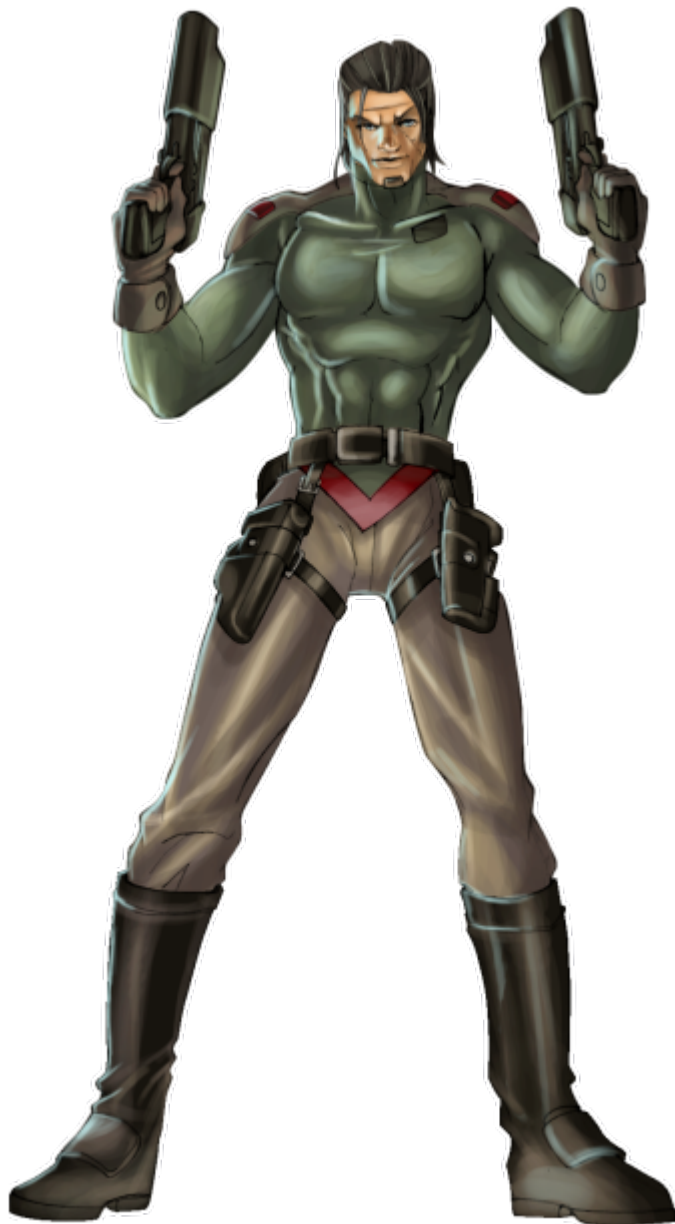
William Howard Harrison