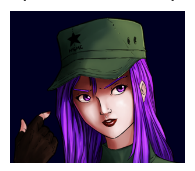
Height: 5' 3" (161 cm) Mass: 105 lbs( 47kg) Measurements: 34-24-33 in (86-60-83 cm) Bra Size: 34B