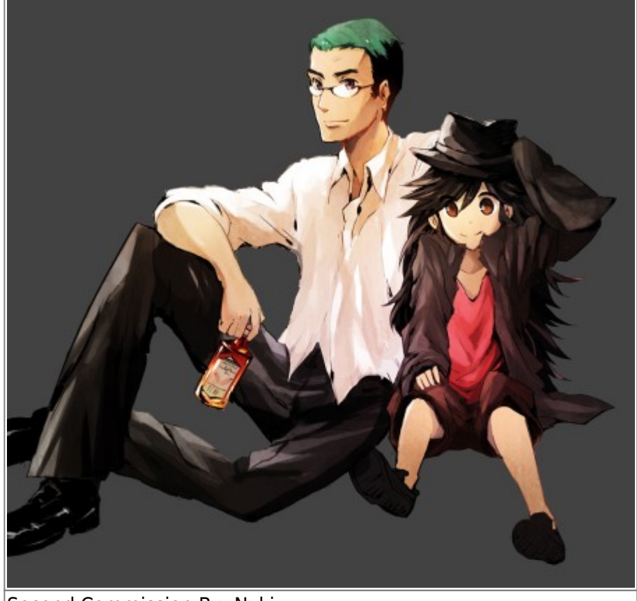
Second Commission By: Nyki