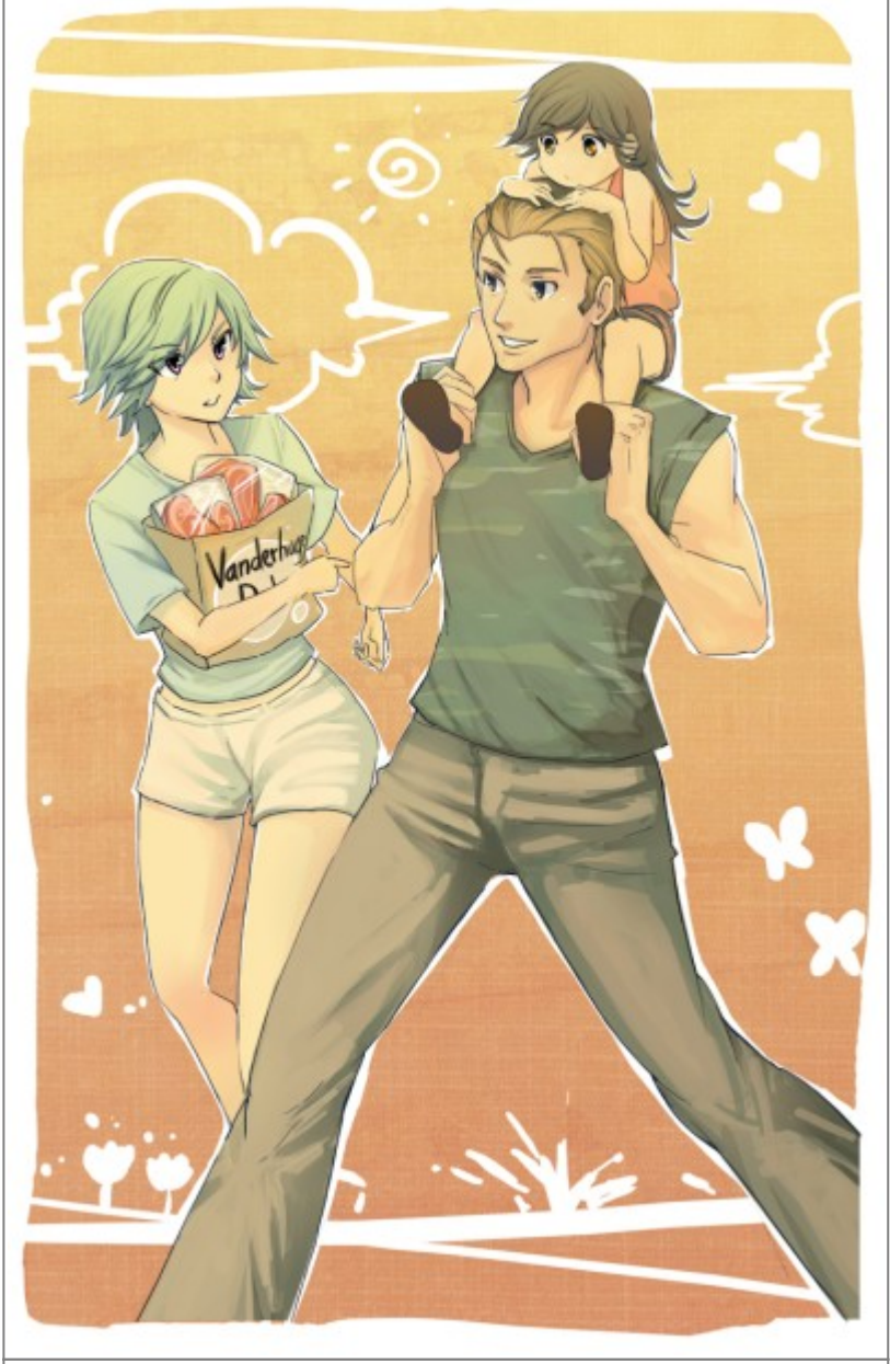
First Carina Commission By: Nyki